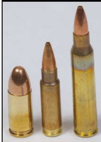
The 5.7x28mm personal defense weapon cartridge (center) represents a new way of thinking about cartridge design for military and law enforcement. By offering range and ballistic capabilities similar to that of a rifle cartridge (R: 5.56x45mm) combined with compact size similar to that of a handgun cartridge (L: 9mm), the new 5.7 is groundbreaking.

« This PDW round was required to be capable of defeating 48 layers of Kevlar, something far beyond the capabilities of the 9mm cartridge. FN's answer was the 5.7x28mm cartridge »»